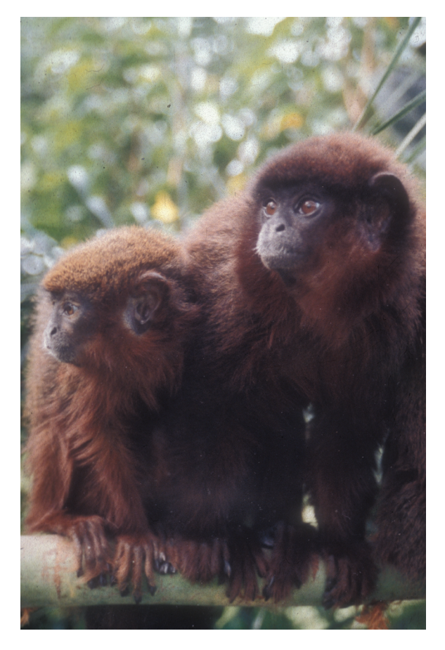
\frac{\textbf{Figure 2}}{\text{A titi monkey infant } (\textit{Callicebus moloch}) \text{ sits in physical contact with his father.}}